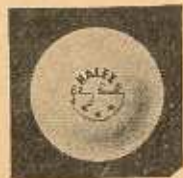
TABLE TENNIS BALLS