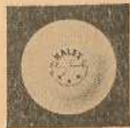
TABLE TENNIS BALLS